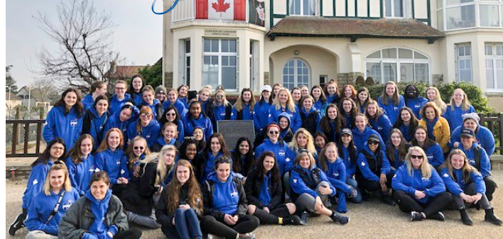
SMA Europe Trip